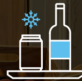
Chilled to Preferred Temperature