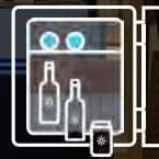
Replenish & Restock