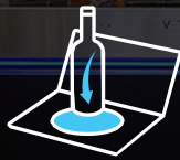
Ease of Use