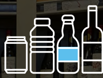
All Types of Bottles & Cans