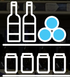
Space Saving Solution