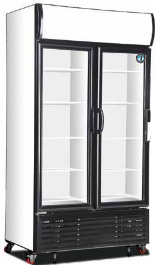
> HSRC 1000DD