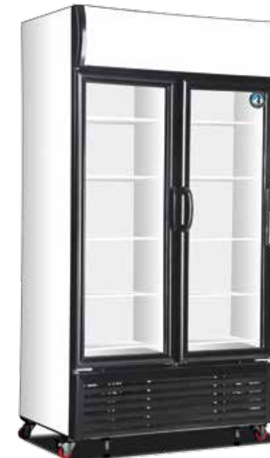
> HSRC 1000DD