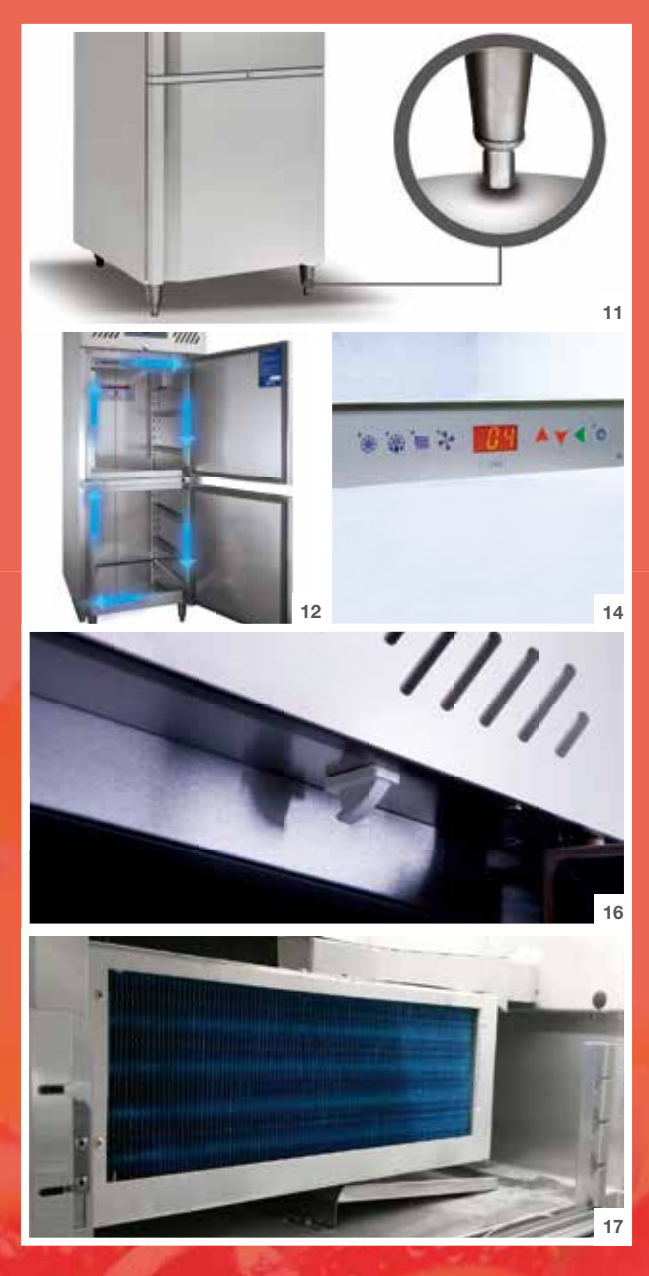
* Not available for FG1T(J) and FG2T(J)