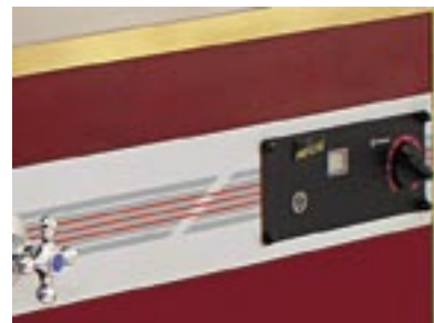
Induction Wok Control Panel