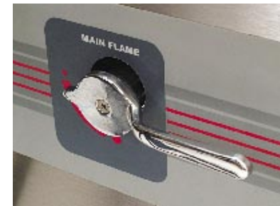
Easy Grip Levers