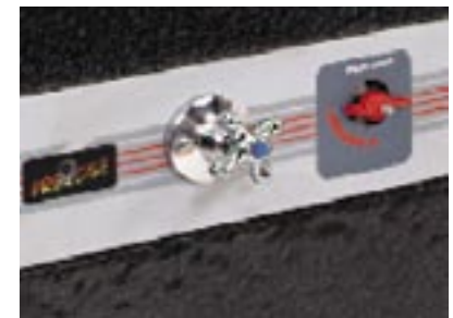
High Quality Finish