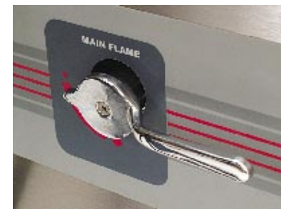
Easy Grip Levers