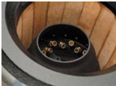
Power Gas Burners with Low Noise Level